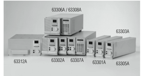
6330A Series High Speed DC Electronic Load Family